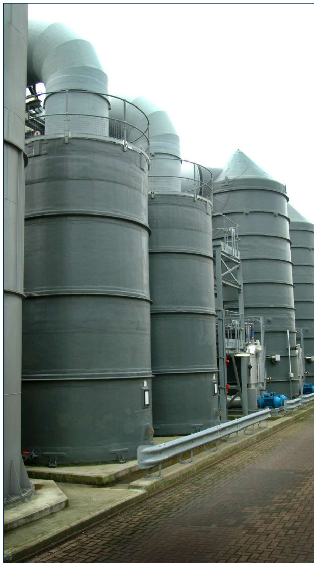
Combined Technology Odour Control - Carbon and Scrubbing