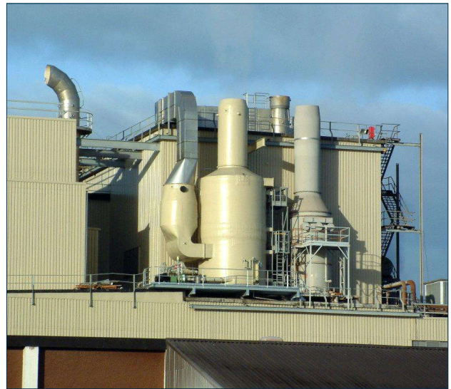
Odour Scrubber Package - fully installed and commissioned - 130,000m 3 /hr

We can choose from all air pollution technologies so that you are assured of an unbiased approach to solving the problem at hand.