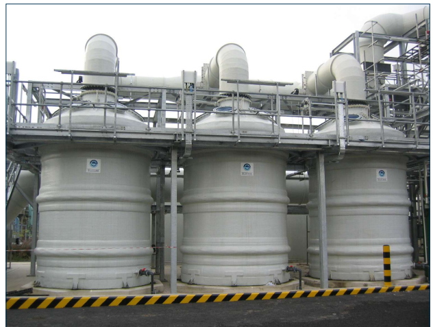
Sludge tank odour control system using a specialist activated carbon