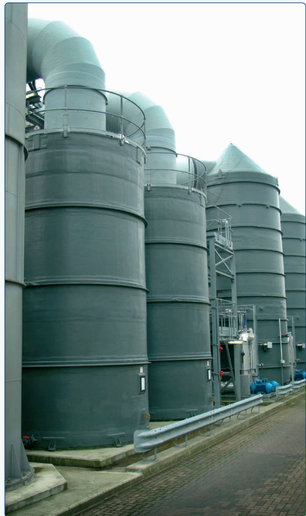
Combined Technology Odour Control - Carbon and Scrubbing