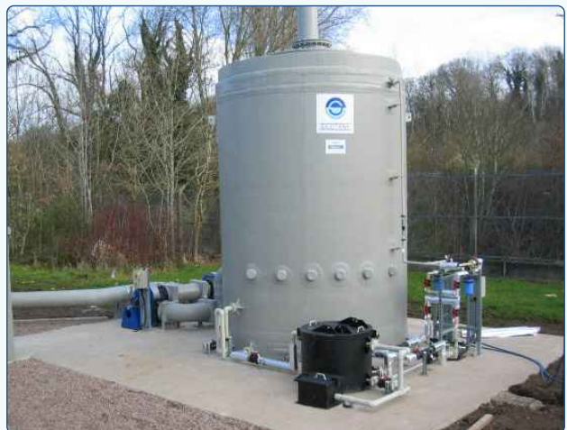
Pem aB to B to filter System with recirculation system and lime neutralisation - 2000m 3 /hr duty