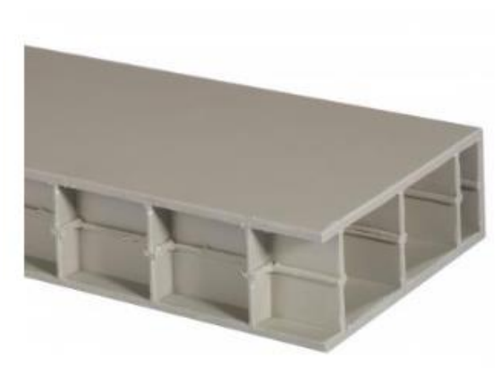
Figure 4.1 - Multipower panel 50/50

Multipower panels are all-round heavy duty panels with an overall thickness of 50 mm and a square cellular core structure with 50 \times 50 mm cells. A simplified technical drawing of the panel including nominal values and standard deviations of the thicknesses is provided in Figure 4.2.